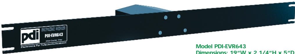
Model PDI-EVR643 Dimensions: 19"W x 2 1/4"H x 5"D