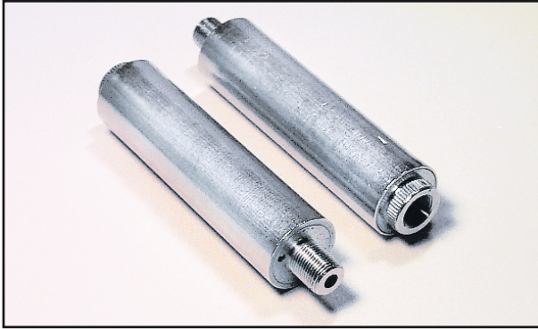
Model PDI-604 Approx. 3.6" long Approx. 0.8" diameter.

The PDI-604 is a filter designed to allow adjusting the level of single channel without effecting the adjacent channels. This device is a very cost effective and simple method adjusting levels that cause interference or overloads. It is ideal for antenna interference, private cable, and residential use.