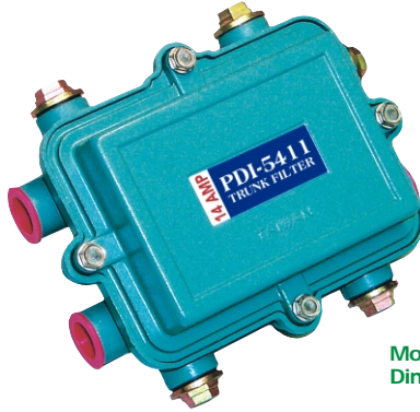
Model PDI-5411 Dimensions: 5 1/2"W x 4 3/4"H x 3"D

The PDI-5411 is a power passing, temperature stable filter designed for trunk or distribution cable applications. It is extremely valuable for blocking sub channel noise from motels and apartment complexes feeding back on a return path. All filter configurations, single channel notch, low pass, high pass, tier or bandpass are available.